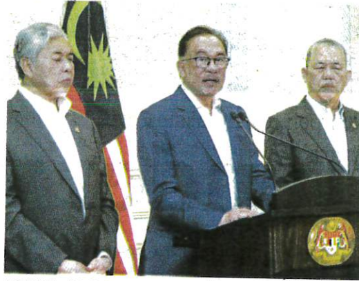
ANWAR Ibrahim bercakap dalam sidang akhbar selepas mempengerusikan Mesyuarat Kabinet di Bangunan Perdana Putra di Putrajaya, semalam.

Beliau berkata, Menteri Kesihatan, Dr. Zaliha Mustafa akan memberikan perin-