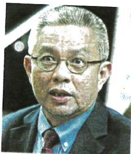
Datuk Seri Dr Adham Baba

"We decided on this presentation of the white paper, primarily because the findings by the (Health) ministry and the law minister on the irregularities or