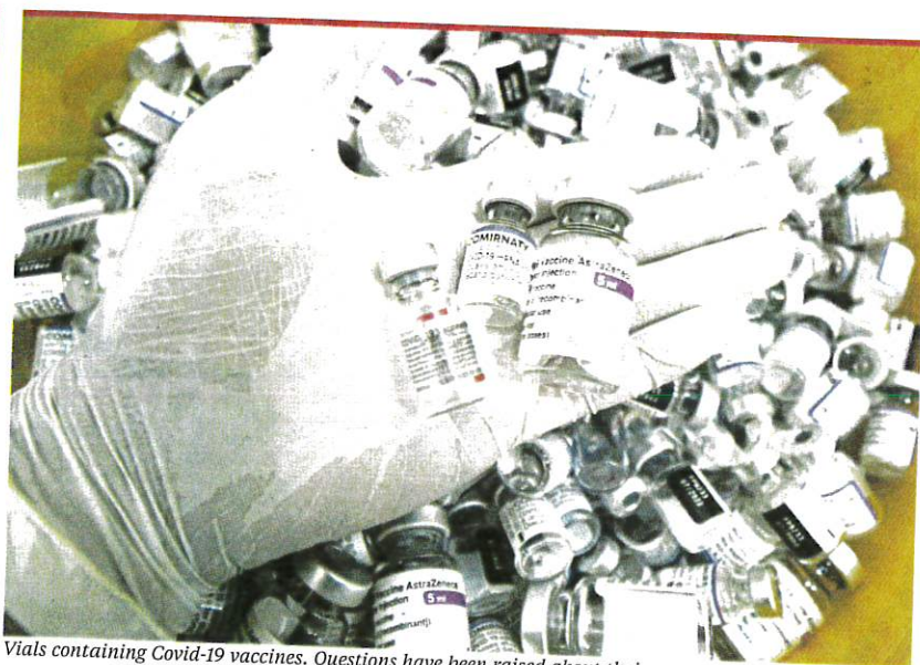
Vials containing Covid-19 vaccines. Questions have been raised about their procurement. FILE PIC